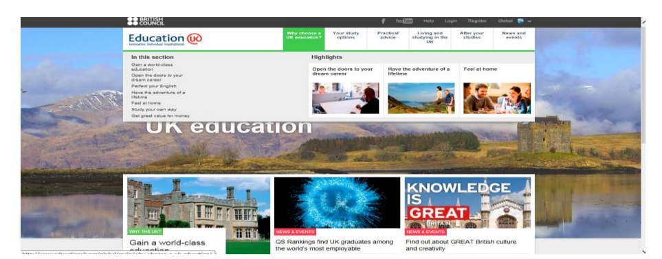
Figure 3. The homepage of British Council's website

In the above excerpt, the BBC response redirects English learners to another website called educationuk.org, which is part of the British Council official website displayed in Figure 3. It consists of a variety of categories and subcategories, designed as micro and macro level hyperlinks, in order to provide information about pursuing education in the UK academic centers.