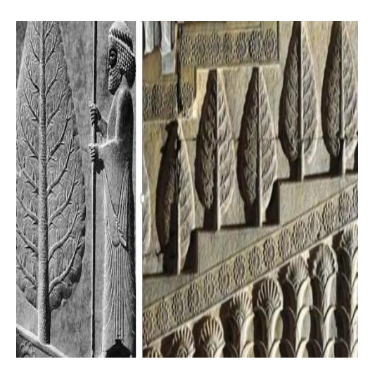
Figure 2. The Cypress Trees Carved into a Stone Wall at Persepolis

We can see the symbol of cypress tree on this "Alam" that Shias use in the Mourning of Muharram and the day of Ashura. Do you know the reasons?