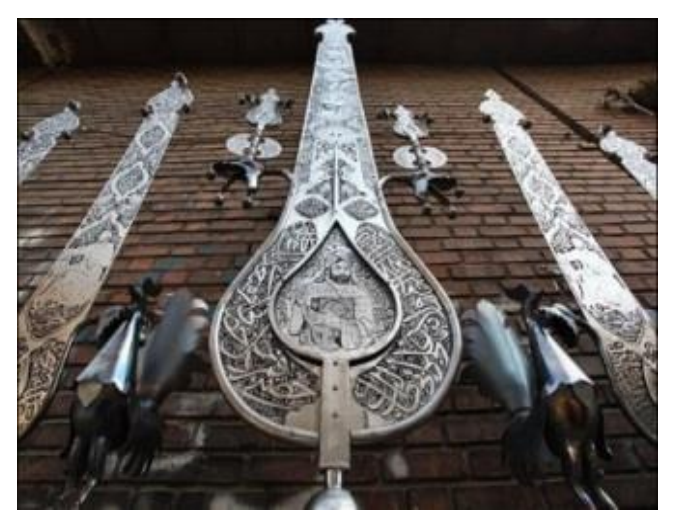
Figure 1. The Photo of an "Alam"

We can see the symbol of cypress tree on this "Alam" that Shias use in the Mourning of Muharram and the day of Ashura. Do you know the reasons?